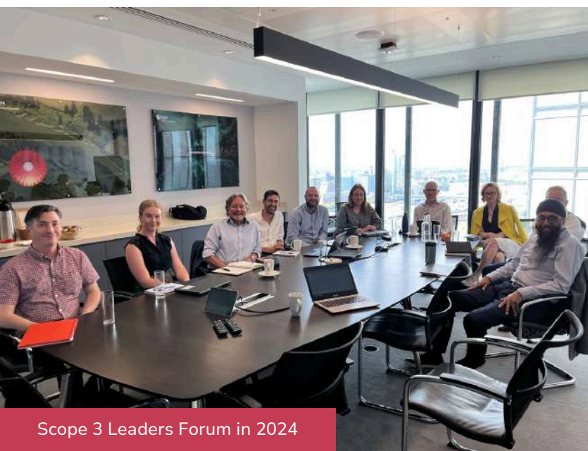
Scope 3 Leaders Forum in 2024

The SFMI works closely with its members to build long-term relationships. Our experts are on-hand to help with any additional services you may need, and our team can provide your company with a wide range of different sustainability services.*