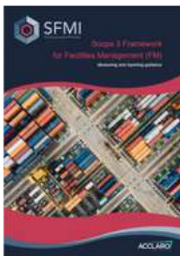
Scope 3 Framework for FM