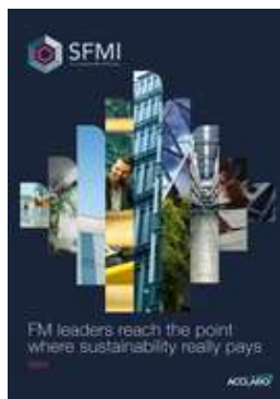
Leaders Reach the Point Where Sustainability Really Pays (2024)